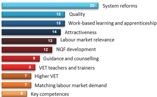
Figure 2. Focus of VET policy reform 2010-14 (number of countries)

systemic improvements, namely legislative or policy changes to adapt existing or introduce new programmes, pathways and qualifications (Figure 2). Other issues, such as improving VET's quality and attractiveness, have also been high on many countries' agendas. Countries have prioritised issues, with some using the Bruges communiqué as a menu to choose themes most relevant to them.